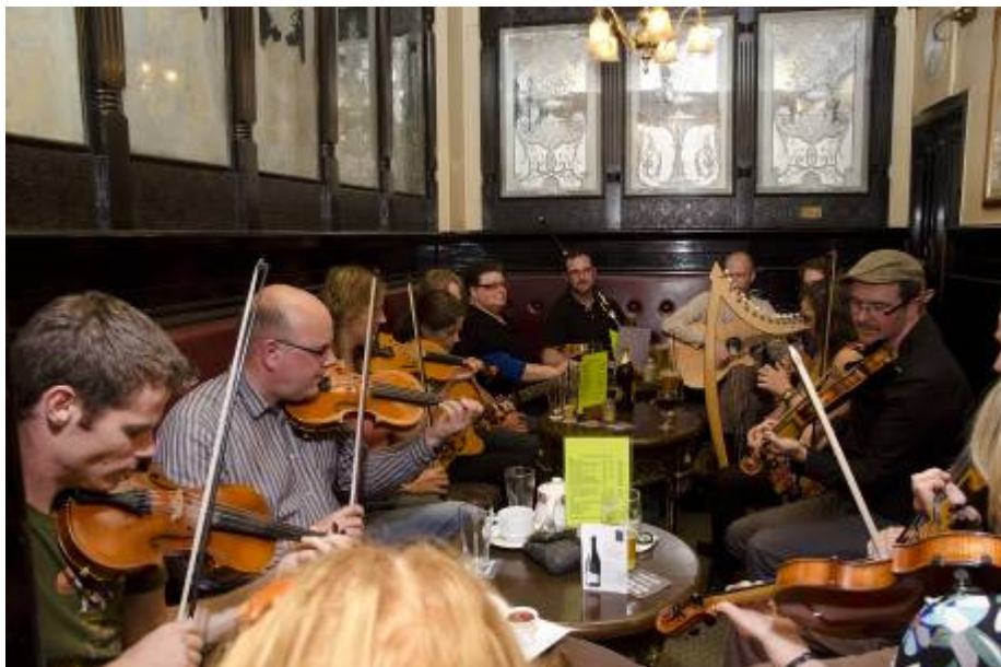
What it's all about!