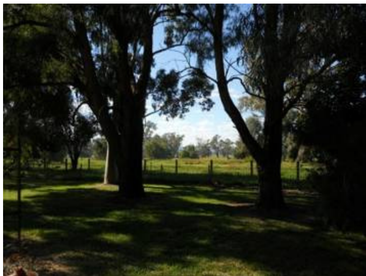
The road into the Marriott's farm