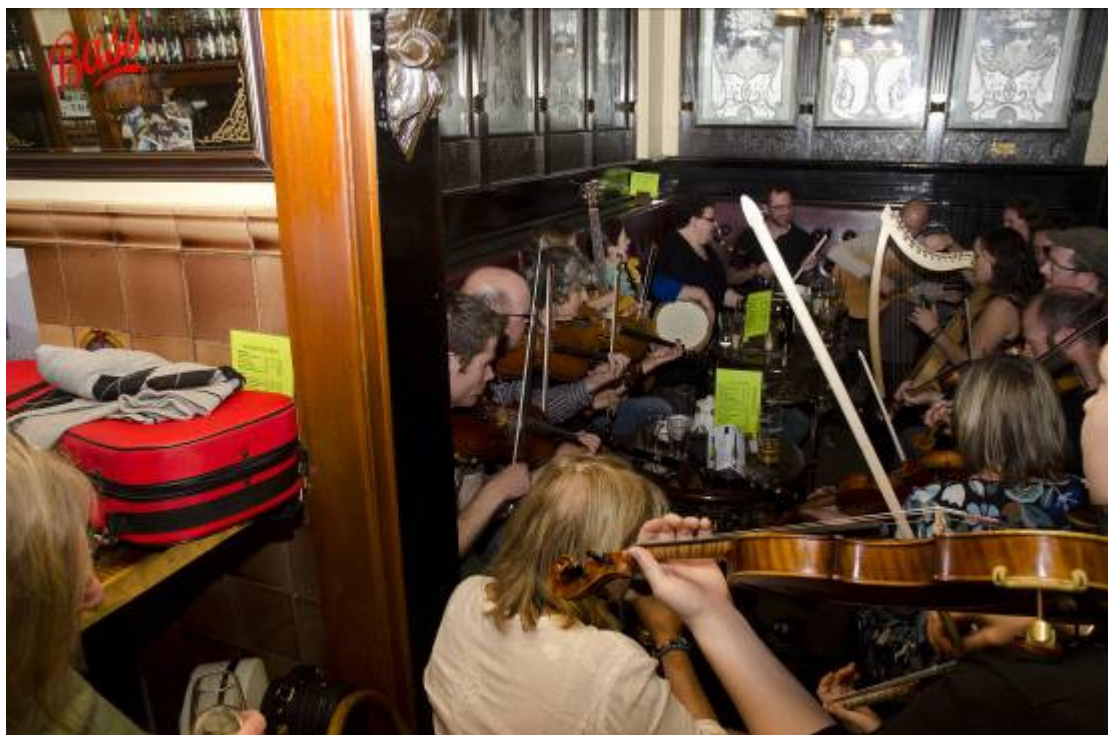
Going for it at The Retreat