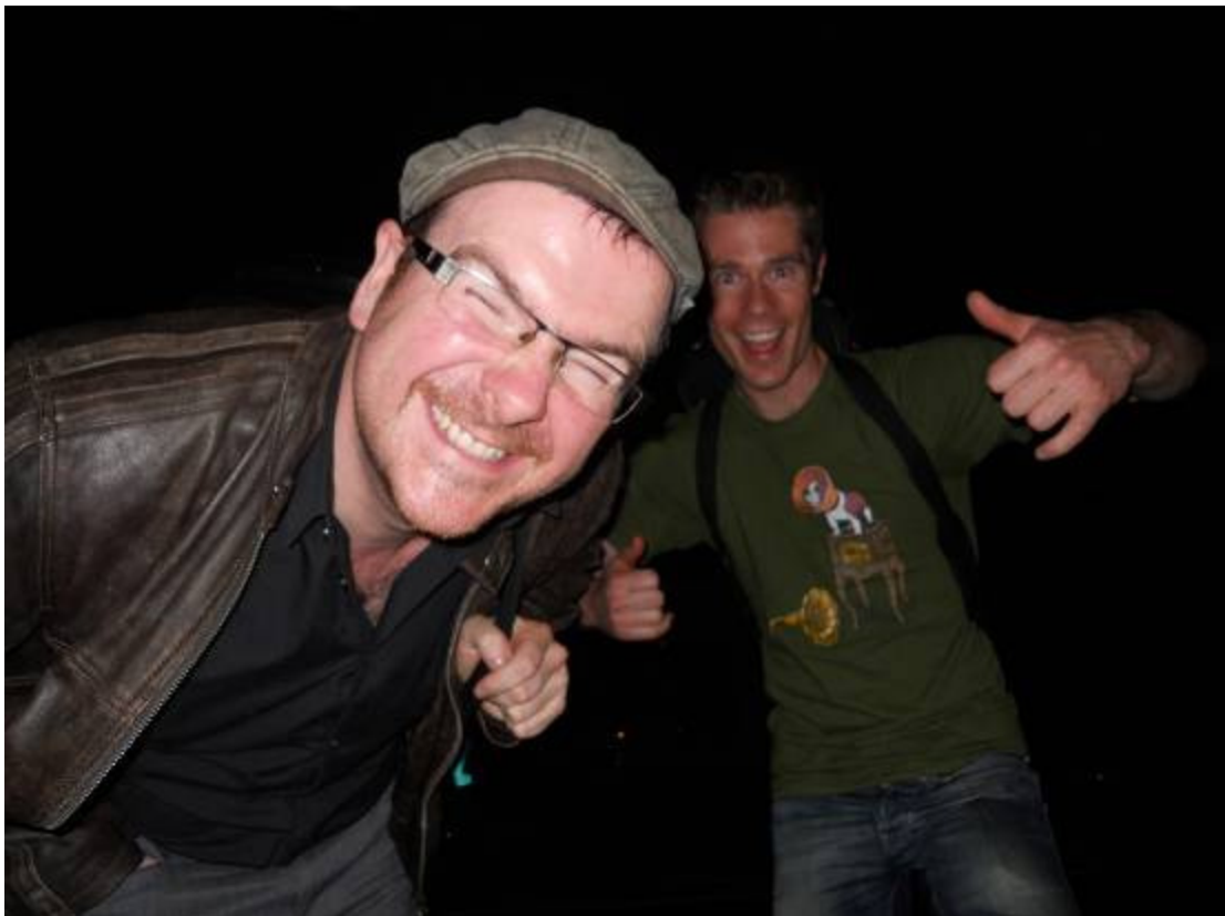
The lads after a few cheeky pints