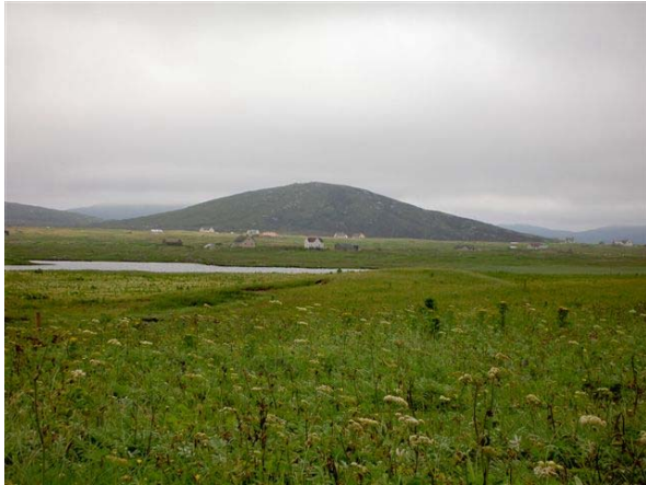
A typical view of the countryside of South Uist, about 4 miles from where the South Georgia Whaling song was written.

In fact, it was written by the MacMillan brothers from the village of Kilpheder in South Uist in Scotland.