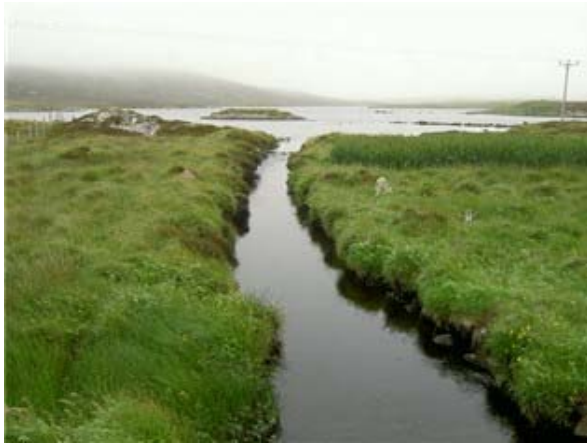
A typical South Uist Scene not far from Flora MacDonald's birthplace

In fact, most of Scotland is sunny today, but I am staying in the middle of a big fog on the Isle of South Uist. Apparently during summer, for about 7 to 10 days, a fog sets in on the Island and then it is very clear for some time. So, I'll have to put up with it a few more days.