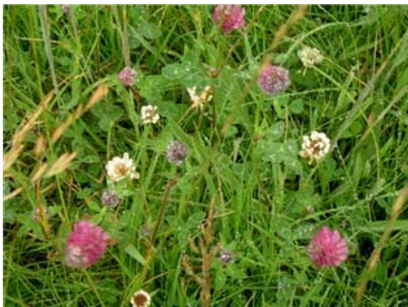
The fields of South Uist are covered in wildflowers at the moment.