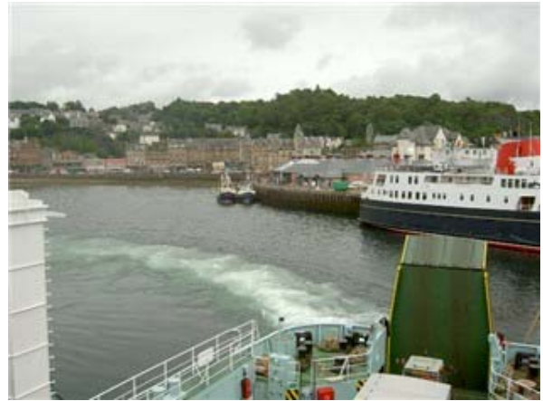
As the steamer leaves Oban...

The Isle of South Uist is in the Western Isles of Scotland, and this island, and the neighbouring island of Benbecula, was the site of a very strange television series in the early 1960s about a pagan Wiccan cult with strange goings on that I won't bore you too much with. But the name of that series was 'The Dark Island' and those on the recent Mansfield weekend will be familiar with the theme song that was written specially for that series. There even is a Dark Island Hotel on Benbecula.