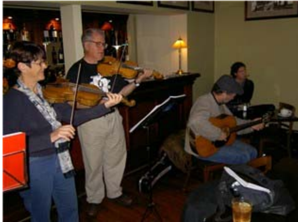
Early morning practice...