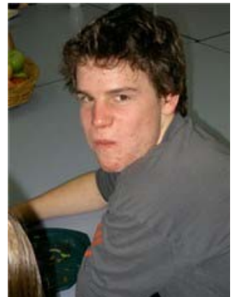
Young people everywhere, playing and eating, and eating and eating...(great food!)