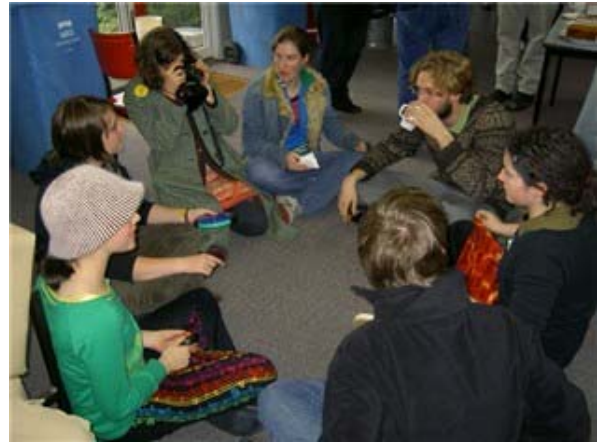
We all had such a great time!